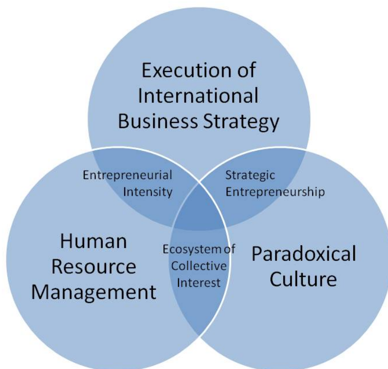
Figure 1: Domains and Concepts in the Theoretical Literature

linked to paradoxical culture (Section 2.2) through the culture and operations of strategic entrepreneurship, a paradoxical concept. This is in turn linked to Human Resource Management by the concept of the ‘eco-system’ or support network and its importance depending on cultural distance. Entrepreneurial intensity as a facet of culture completes the circle back to strategy.