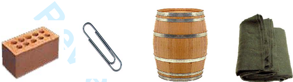
Figure 1: Familiar artifacts used for the functional fluency task in Experiment 1 and (with exception of boot polish) Experiment 2.