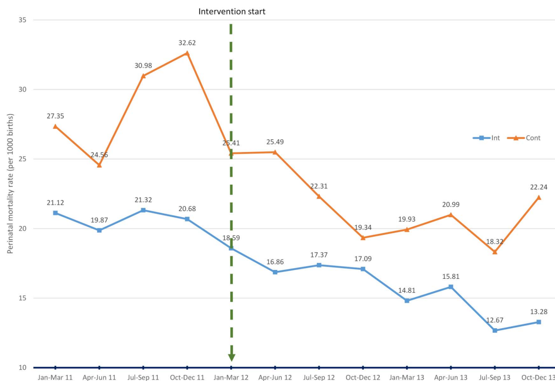
Figure 2 Interrupted time series: district health facility perinatal mortality rate (per 1000 births) comparing intervention districts (Int) with control districts (Cont).

However, comparison of the standardised relative effects shows that there is a consistent reduction in the intervention districts compared with a consistent increase in the control districts (table 3). Figure 3