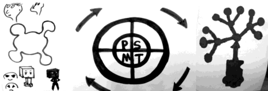
Figure 3: A selection of designs developed by workshop participants.

With six female and four male participants, the workshop had a near-even gender balance, something that Marshall has experienced as difficult to achieve in technology focused workshops (Briscoe/Mulligan 2014). Participants ranged from experienced software users to those with no technical experience. Everyone managed to create their own design and translate this into a printing block and audio clip. Significantly, only a few participants (all male) produced technology or tool related imagery – most participants created abstract, diagrammatic or human-centred images to express the values they associated with Litchee Lab and making (see Fig. 3).