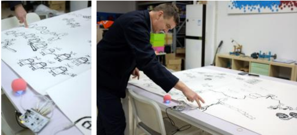
Figures 4 and 5: Final poster including the ‘touch board’ and speaker that enables the audio files to be played.

Simpson recognises the benefits of a dialogical, open-ended, ‘crafty’ approach, that perhaps can be contrasted with design workshops that aim for conclusive action and closure, rather than increased communication. As a sign of its success, Li and Simpson have repeated the workshop with a group of secondary school teachers, and it was again well received.