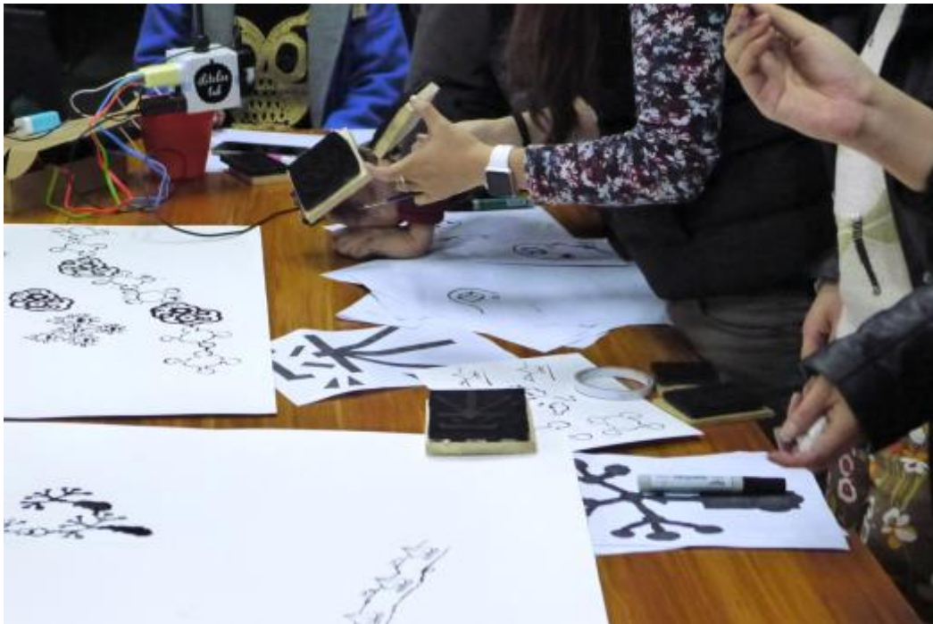
Figure 2: Laser engraved printing blocks derived from participants drawn designs.