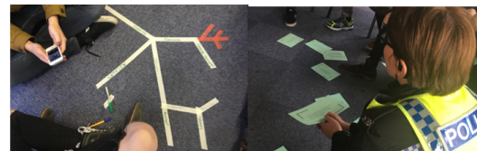
Figure 1: Young people and police officer in workshop 1

In response to this, we consider how HCI research can communicate the risks people face without reproducing stigmatizing narratives of passive vulnerability. We reflect upon the ways that visual communication design was used to communicate our findings by depicting ambivalence towards vulnerability to hate crime. We argue that by including ambivalent elements in our communication design we can 'trouble' ideas of vulnerability and resist static narratives about our participants' identities.