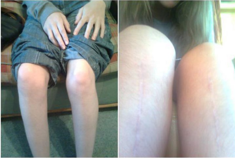
Figure 3. Kate's legs before and after surgery, included in her photo journal.