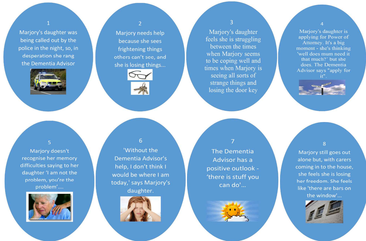
Figure 2 – Example of Picture and Word Cards Preparing for the Workshops and Using a Storyboard Approach to Data-generated Vignettes of People’s Experiences of Changing Groups