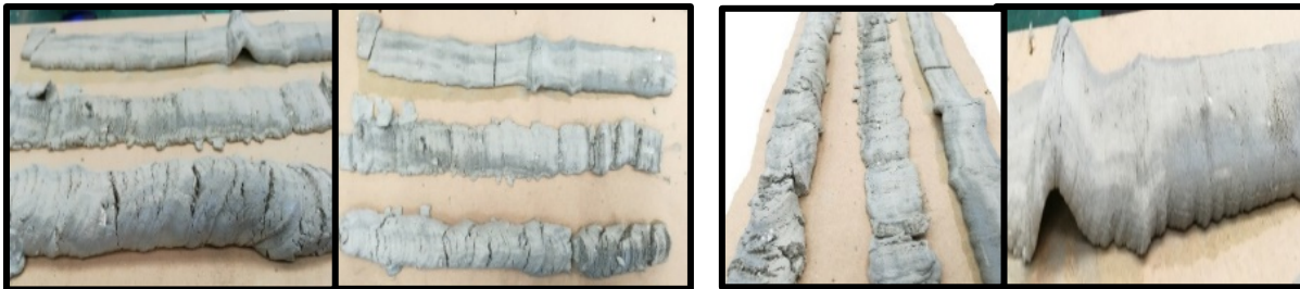
Figure 3, 4. Side view, Top View

Figure six clearly shows the problem if the timing of extrusion at z-direction is not calibrated with the speed of the nozzle in x-direction.