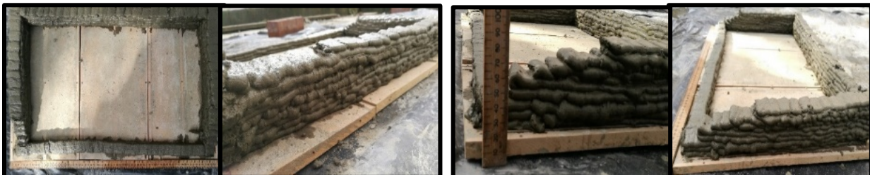
Figure 7, 8– Top view of structure, Side wall, Figure 9, 10 – Layers deposition of structure, Side view

Using the extrusion nozzle a proof of concept design was created. As shown in Figures 7 to 10 small structure was created by using an oval head nozzle at an angle of 45 degrees. The extrusion was not continuous and not even align perfectly since the capabilities of a hand-held mortar gun are limited but even with that limitation a 100 mm*450 mm*700 mm structured was printed layer by layer. The illustrations below represent the surface of the walls if there were straighten out while each layer was introduced that is creating a further outer bonding between the layers.