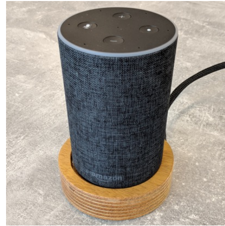
Figure 1. The Spkr device

Previous work has demonstrated that smart home technology can be employed in a variety of ways to bring socio-political, and related, discourses to the fore within the home. The home presents a complex web of social rules and constraints for technology, which it is often forced to operate within. Baillie and Benyon [4] examined the role of digital technologies within the home, and amongst their findings highlight the power struggles between family members over pieces of technology, such as who a shared device belongs to, and the way a device’s purpose may have different perceptions amongst the family. More specifically focused on smart home devices, Porcheron et al [58] studied Amazon Echo use in households and found that collective processes across members of a household emerged to control the devices, such as when the device could not understand one household member’s commands. Kirman et al [39] approach these social dynamics as an opportunity for the design of smart home technology. They describe an embodied agent, Nag-baztag , that uses speech and other visual cues, unprompted by the user, to encourage the household members to conserve energy. Of note, they detail how the device verbally admonishes those who are wasteful of resources, using