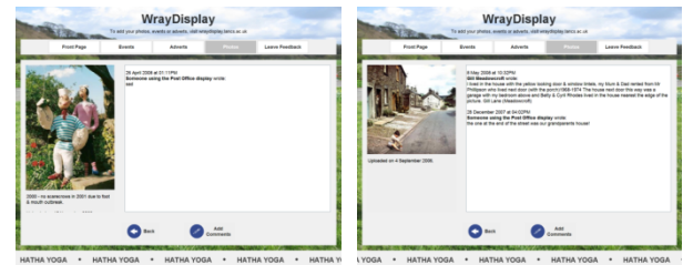
Figure 6: Two screen shots showing: (a) an image from the “Scarecrows” category with a caption (left), and (b) an sample images included in the “Wray Flood” category (right).

(such as Wray) during the turn of the millennium. One user has responded to this with a poignant comment: “Sad”.