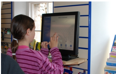
Figure 5: A young resident entering a comment using the on-screen keyboard.

We implemented the commenting feature using a reasonably straightforward on-screen keyboard. Figure 5 shows the display after it was moved from the village hall to the local Post Office with one of the younger village residents making use of the system’s commenting feature.