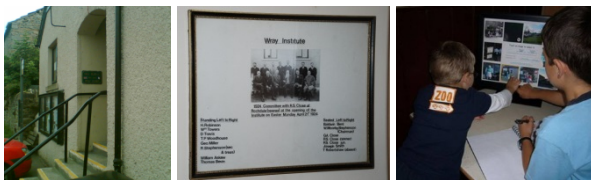
Figure 2: a) Wray Village Hall (left), b) Historical photos on display in the Wray village Hall (center), and, c) Deployment of the first display prototype in the Wray Village Hall (right).

The first display (see Figure 2c) was an extremely simple prototype: a touchscreen display connected to a concealed computer which showed pages of ten thumbnail photos, with on-screen controls to move back and forward through the photo. Photos could be transferred to and from the display using Bluetooth file transfers from mobile phones. In terms of hardware, the display application was driven by a Mac Mini which was selected due to its near-silent operation and small form factor (that allowed it to be placed out of view) and the display itself was a resistive touch screen monitor.