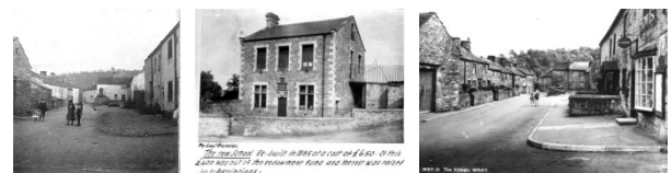
Figure 3: Sample images included in the "Old Photos" category.

These early comments signified at an early stage the importance that cultural heritage was going to play in the project.