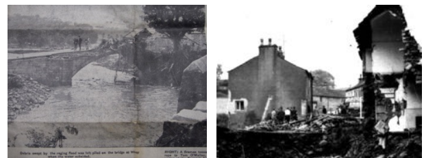
Figure 4: Two sample images included in the "Wray Flood" category.

Shortly after the addition of the "Old Photos" category (which typically contained photos of Wray from 20 th Century) a new category was added called "Wray Flood". The Wray flood occurred in 1967 and the first images to be uploaded to this category were clearly scans of newspaper pictures (see Figure 4). Later photos added to the "Old Photos" category were more varied, with photos from the past twenty years included, often group