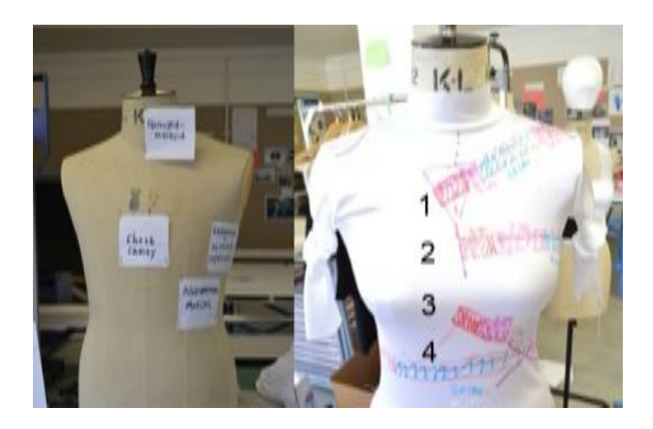
Figure 2 – Positioning the sensors