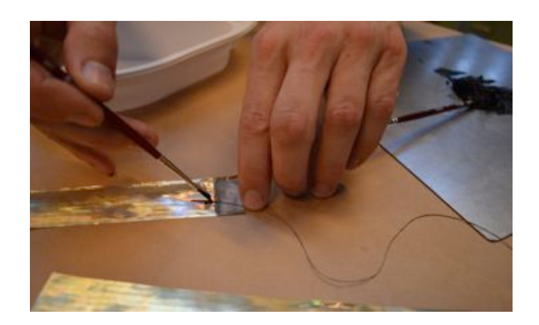
Figure1 - Handcrafting bespoke sensors