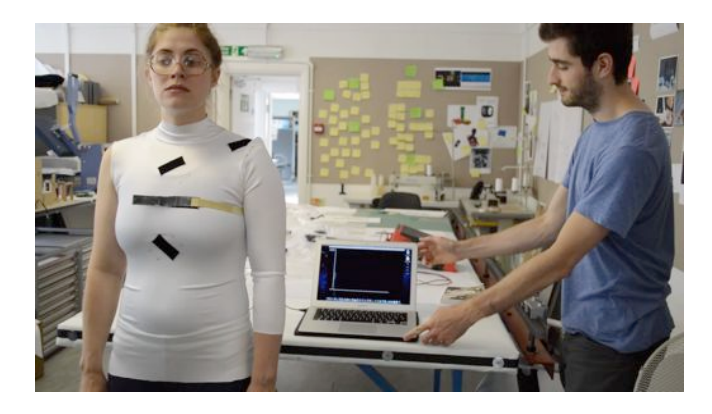
Figure 3 - Taking live readings

The vest is worn by the wearer. One at a time each sensor ribbon is placed on its set anchor points, secured and connected to the laptop. Once the wearer is connected a live reading is taken (see Figure 3). The wearer is asked to undertake a number of tasks, such as shallow breathing, deep breathing, normal breathing, inhale and hold, exhale and hold, swallowing and chewing to stimulate different breathing patterns. The wearer is asked to perform each task twice, resting for 1 minute between each task to regulate breathing. Every task is video recorded and the live graph readings are video recorded with sound. The sensor ribbon is removed. The same sequence of tasks is then repeated for each sensor ribbon on its set position and recordings taken (see Figures 4 and 5). An arduino pro mini was used due to its reduced size, however the ATMega processor and external components remained the same as the third method for data collection.