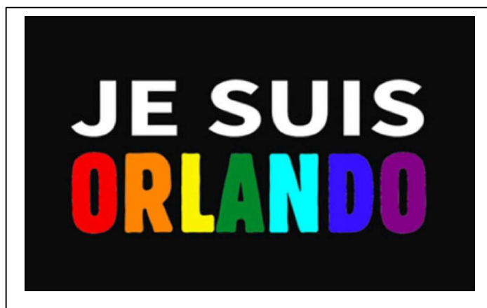
Figure 2. User-created variation on #JeSuisParis.

Furthermore, recent traumatic events following major terrorist attacks in Europe have produced a repetitive artistic and digital lexicon that relays emotional powers in both offline and online spaces. After the November 2015 Paris attacks, the JeSuisParis hashtag (Figure 2) appeared in millions of globally circulating social media feeds. Users often applied creative filters to images of important 'offline' landmarks, such as the Eiffel Tower, and national symbols including the French Tricolour. By incorporating such imageries in user-created content, highly recognisable symbolic sites and regional symbols were re-enacted to provide digitally mediated encounters with senses of empathy and immediacy (see Bell and Lyall, 2005). Material matter became simultaneously over-layered by computer-generated, networked visualisations along urban imaginaries that are rooted in everyday lived spaces from the street and city to the state and the global (see Rose, 2016). Thus, this engendered new multiscale experiences of an interstitial 'digital third space' (Potter and McDougall, 2017). With the previous examples, we have pointed out that online spaces, as interlaced with material spaces in highly complex ways, have been central to the dissemination, replication, alteration and networking of public discourse, social relations, interactions and actions with both actual and virtual outcomes.