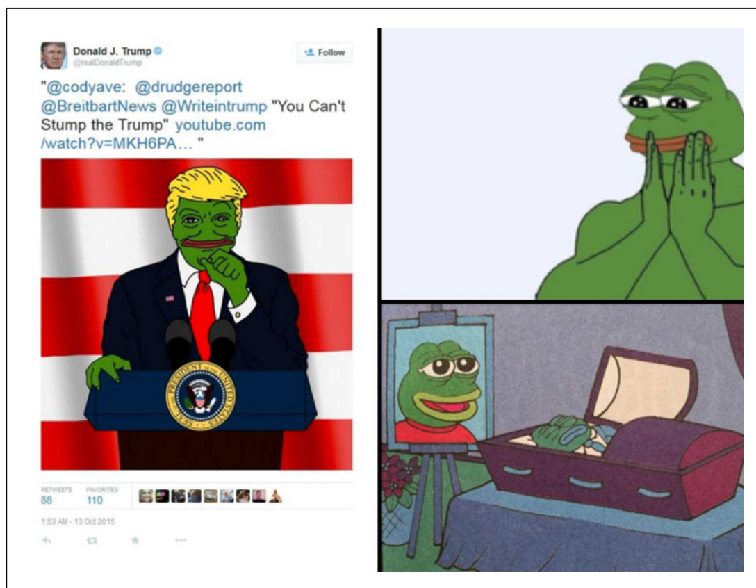
Figure 1. Top right: Alt-right variant of the Pepe the Frog internet meme, which became a white supremacist mascot. Source: public Facebook page, June 2017. Left: Tweet by Donald Trump on 13 October 2015: Pepe the Frog for president. Source: public content from Know Your Meme (2017a). Bottom right: Matt Furie, Pepe the Frog's creator, responded with a cartoon that 'killed off' Pepe, after it was felt to be hijacked by white supremacists. Source: public content from Know Your Meme (2017a).

rooted in, and enabled or disabled by, unique national and local territorial and material geographies and places-specific cultural praxes.