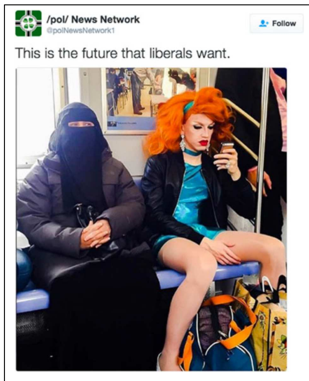
Figure 3. 'This is the future that liberals want'. Source: public content from Know Your Meme (2017b). Original Twitter account (@polNewsNetwork1) suspended.

'GIF attack', show how digitally mediated art practice may meld with physical acts of violence. Incidents like these have changed the relationship between digital space, crime and punishment very consequentially. They therefore represent an unnerving new angle to the discourse of how social relations are mediated through the digital.