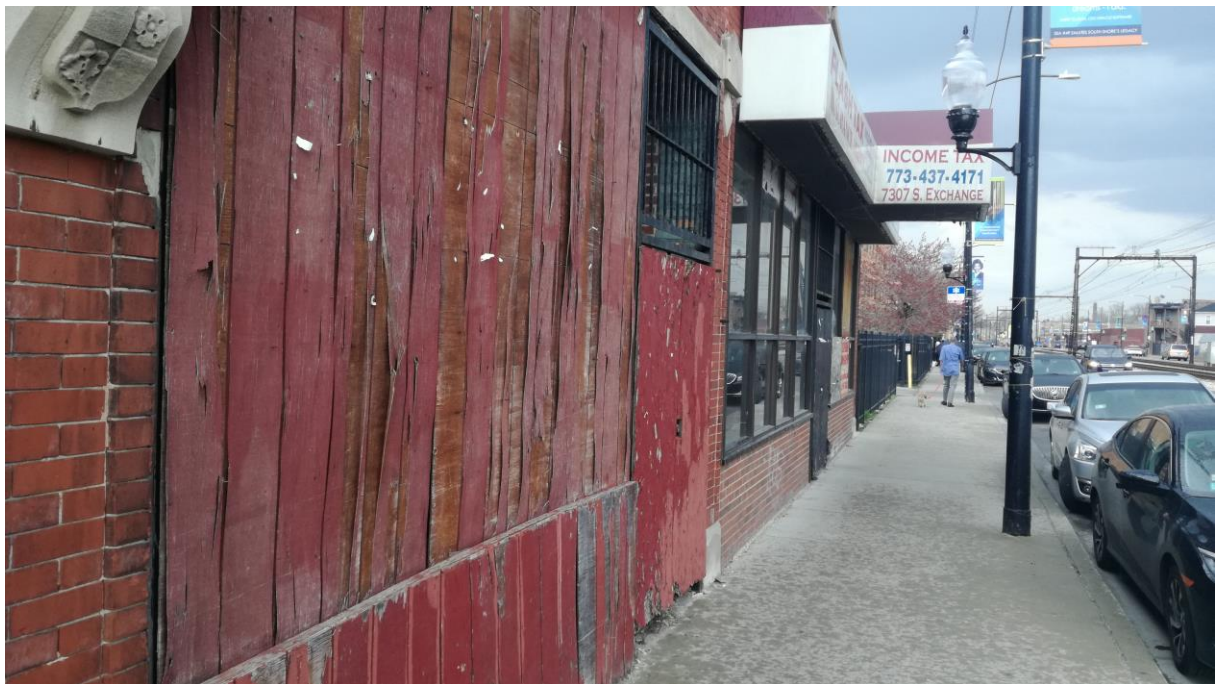
Figure 1: Vacant store on 71st street, South Shore (Authors' photograph, 03 May 2018)

characterize them, only interrupted by several liquor stores, hairdressers, and occasionally, a café or restaurant (see figure 1).