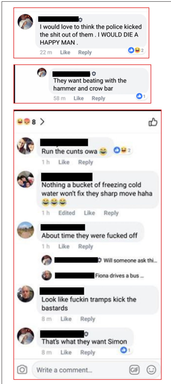
Figure 3. Facebook comments.