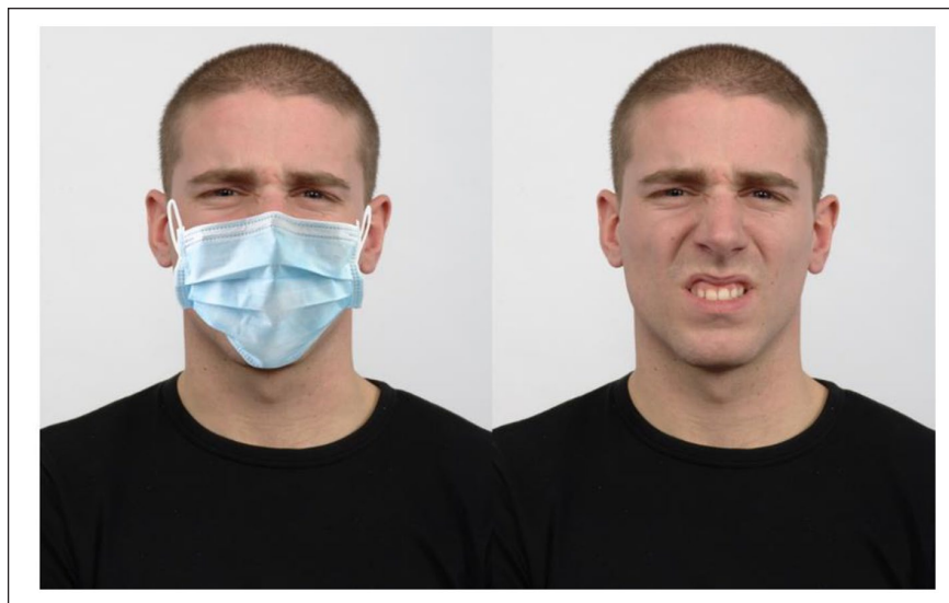
Figure 1. Example stimuli (left masked, right unmasked), with both images of a model presenting the emotion of disgust.

Smithson, 2020). Langner et al.'s (2010) study also validated the facial stimuli to ensure that facial expressions of emotion were of average intensity. As part of Langner's validation study of the Radboud Database, participants were asked to rate each face, on a five-point Likert-type scale ranging from weak to strong, regarding the intensity at which each emotion was facially expressed. As emotions tend to be facially expressed with average intensity within typical everyday interactions (Motley & Camden, 1988), this study utilised face stimuli where emotions were deemed to be expressed with average intensity as validated by Langner et al. This study also utilised 12 models to present emotions acceptably within one standard deviation of the intensity judgements from all 57 models, while also having a high emotion agreement, in accordance with Langner's validation of the Radboud Faces Database. See Figure 1 for an example of a model expressing disgust both with and without a mask overlay.