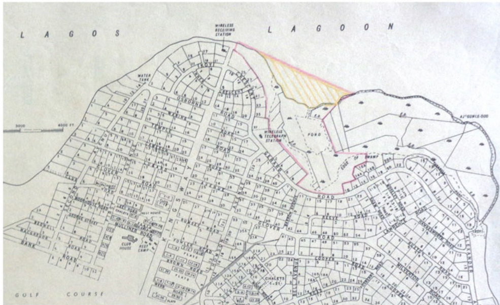
Fig. 2. Detail of a 1955 plan of Ikoyi. Note the low-density plots for bungalows in the north and east, and the denser concentrations of flats in the south west. The 'building free zone' separating the reservation from the city of Lagos was occupied by the golf course marked in the south west. The area on the banks of the lagoon hatched in pencil was the site for a proposed land reclamation project.