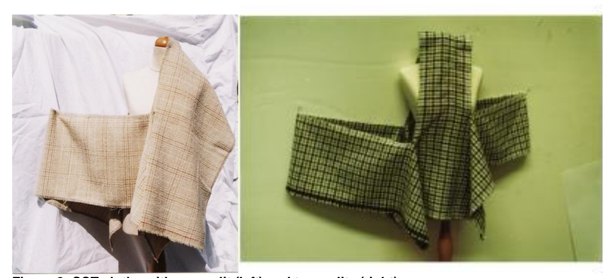
Figure 2: SCT cloths with one split (left) and two splits (right)

The Researcher then experimented with SCT in half- and full-scale and developed toiles see Figures 2-4 below as well as finished, wearable garments.