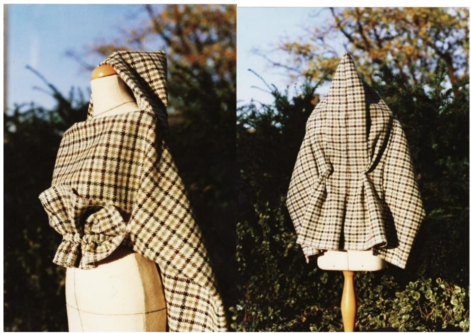
Figure 4: Sample of a SCT toile - experiment with two splits