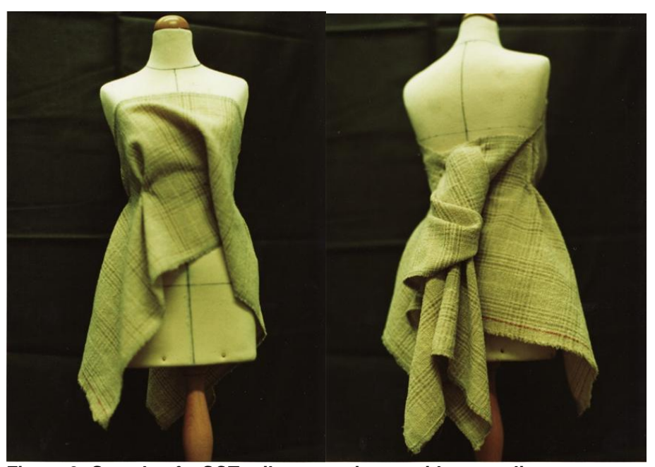
Figure 3: Sample of a SCT toile - experiment with one split