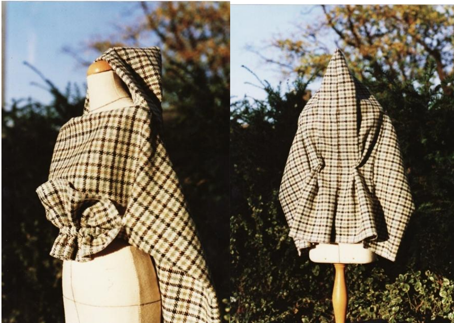
Figure 4: Sample of a SCT toile – experiment with two splits