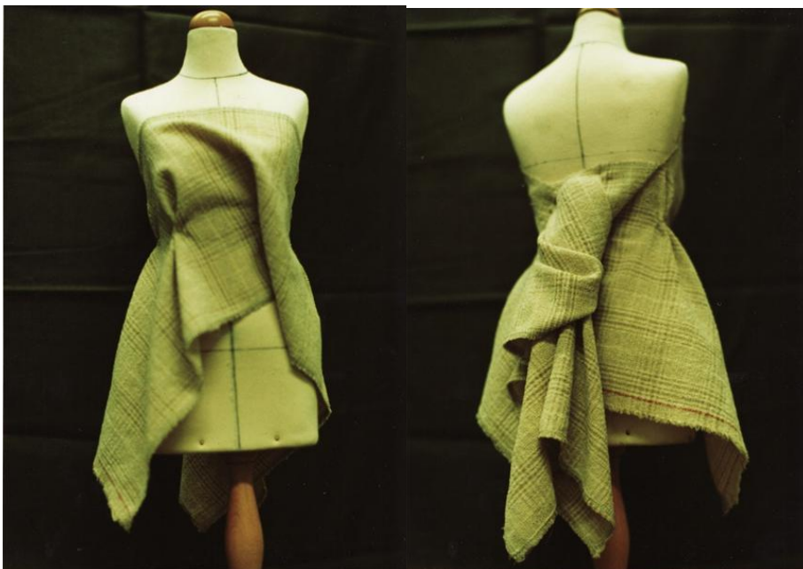
Figure 3: Sample of a SCT toile – experiment with one split