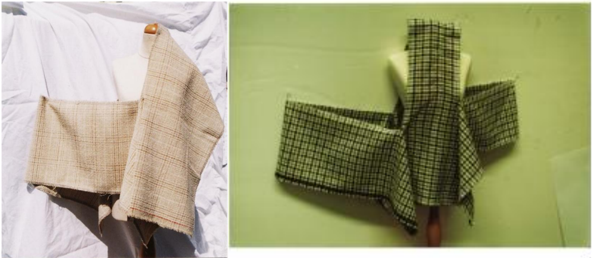
Figure 2: SCT cloths with one split (left) and two splits (right)

The Researcher then experimented with SCT in half- and full-scale and developed toiles see Figures 2-4 below as well as finished, wearable garments.