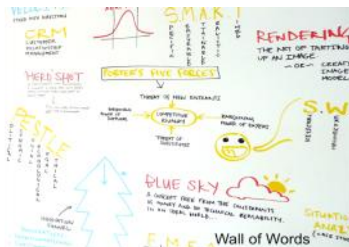
Figure 3: 'Wall of Words'

Gen Doy explains that students and researchers who move from one discipline to another “encounter languages and cultures which may seem alien, or perhaps welcoming. They feel uncertain and lacking in confidence sometimes, because they do not feel “at home” in the new discipline...”. (Doy, 2008) As a greater understanding of each others’ language is gained and the prototype is refined, not only will a common language be learned, but a common vernacular for multidisciplinary innovation practice will develop and become an ‘at home’ in a space tailored to support this development.