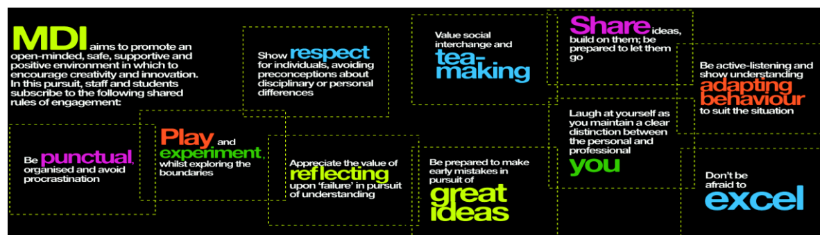
Figure 4: Terms of Engagement

Perhaps the most relevant of these to conclude this paper relates to “active listening and adaptive behaviour” and “respect for individuals”. The programme focuses on developing the individual and their confidence to participate through the ‘safe environments’ described. The importance of the individual cannot be over-stressed as it is only through self-awareness that the individual can become an effective team member. Staff and students have to be adaptive and flexible in their approach and willing to admit when they don’t know the answer! This approach has allowed the building of a strong dialogue between students and staff that will guarantee mutual reflective, innovative and creative learning.