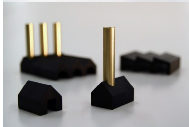
Figure group 2. Desk Top Empires.

A series of wedges, vee blocks, shims and packing blocks that can be used in a machine shop or can be transformed into your own Desktop Empire. These devices are important in holding work steady for accurate precise machining of engineered and designed product. The Blocks are wrought from Iron, Mild Steel and Brass with design skill.