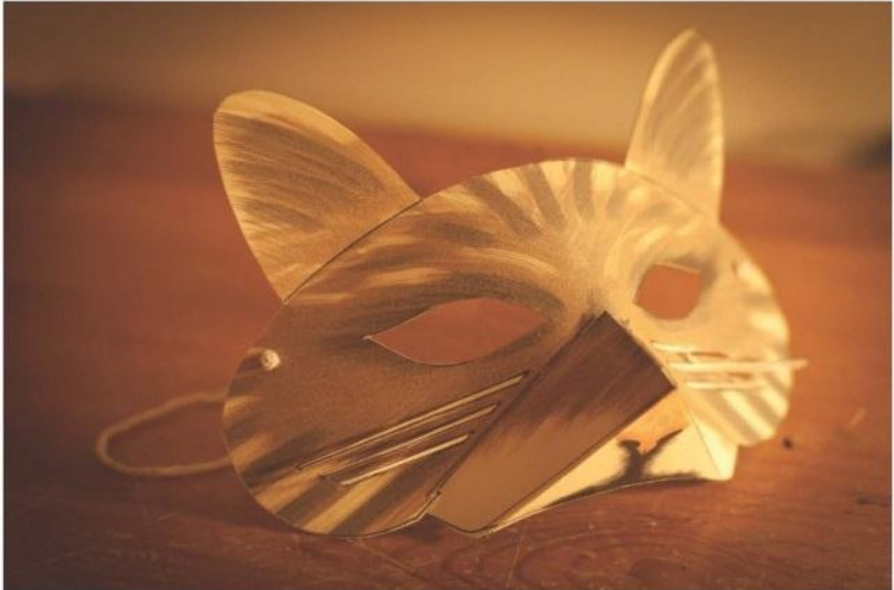
Figure 2: A mask from the 'Puss in Boots' story

Secondly, a relationship that was supported by all interviews that discussed it was imagery altering perceptions and the critique of design concepts. For example, one team developed a ticketing system for a festival and the story that was presented to showcase this concept involved the use of fairy-tale characters such as 'Puss in Boots' (see figure 2), as they had symbolic relevance to aspects of the ticketing system.