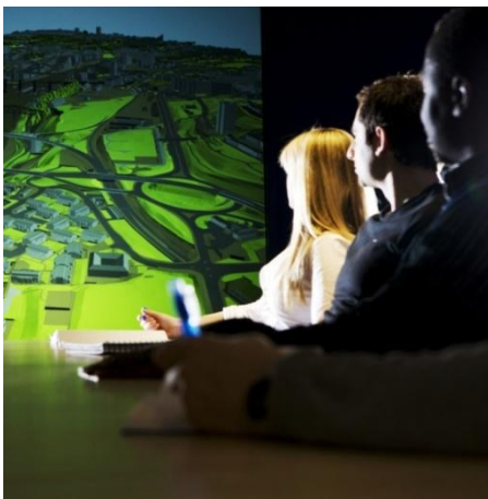
Figure 2 Sharing city model data in a collaborative environment

Northumbria University, School of the Built Environment has been developing a 3D model of NewcastleGateshead for the purposes of education and research, and has used this model to raise awareness of the benefits and potential of the technology to the city authorities of Newcastle and Gateshead, both currently challenged by significant levels of regeneration activity. The model currently covers an area of 8 sq km and original data was provided by UK data provider ZMapping. The university has optimized this data and uses software platforms AutoCAD, 3DS Max and VR4MAX for modeling different levels of detail and enabling interaction with the model. This model can be displayed to individuals or groups of people in the School's Virtual Environment facility. This facility supports interactive navigation, stereoscopic projection and is based upon PC hardware.