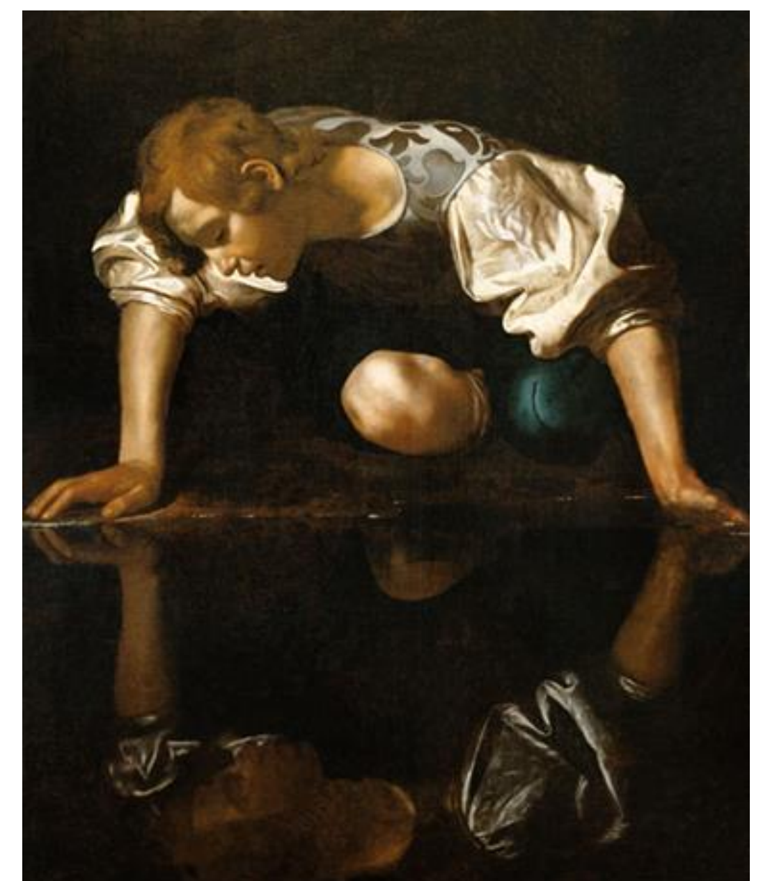
According to Greek mythology, Narcissus starved to death as he could not tear himself away from his own image. Picture by Caravaggio (1597)