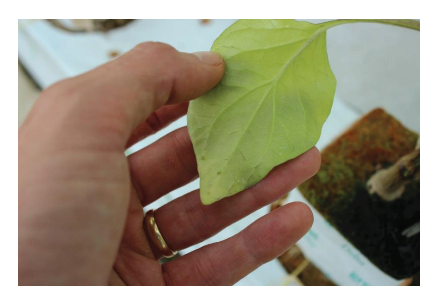
Figure 4. Pepper leaf with Aulacorthum solani on abaxial surface (NB: aphids were recorded from all plant parts).

Once sufficient pest levels had been reached, plots were treated with pesticide products at concentrations recommended by manufacturers, deployed in water such that all plots in a given experiment received the same overall spray volume (750 L/Ha/mch). Each treatment was applied by qualified personnel using a single-lance Oxford Precision Sprayer, fitted with a hollow-cone nozzle, at approximately 3 bar pressure. Due to the nature of the biopesticides being tested, care was taken to ensure complete plant coverage and thorough mixing of products (in water) prior to and during treatment delivery, with pest counts made six days after each application (6DAA). The timing and number of applications for some pesticides varied within trials to conform to existing or anticipated regulatory requirements and product labelling. This was particularly so for industry standard pesticides, which were often applied on a reduced number of occasions to conform to existing constraints on their use (see Table 1), as informed by product information held in the LIAISON pesticide database <<li>liaison.fera.defra.gov.uk/>>.