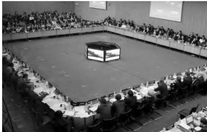
Figure 1: FATF Plenary in session February, 2012