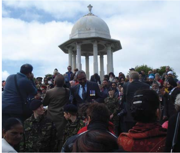
Figure 5. Participants converge on the steps of the memorial for a final group photo, June 2013.

emotional memories of historical experiences particular to India, not necessarily connected to the Chattri, which they perceived as a time of unity and belonging within their community: