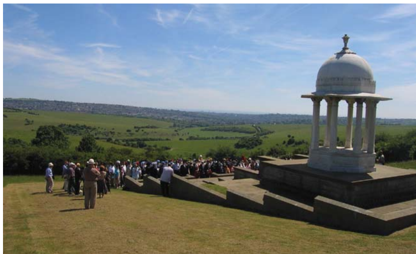
Figure 3. Chattri Memorial ceremony, June 2005.

presence of a military motorcycle group in leather regalia, bearing witness and expressing solidarity with war dead, added to the heterogeneous sensibility of the space. Assorted audiences come from across the country – Indian descendants, local residents, Black history enthusiasts and ethnic organisations mixed with official invitees, which grew after 2000 to include the Queen’s representative, the local Marquis, and the Indian High Command: