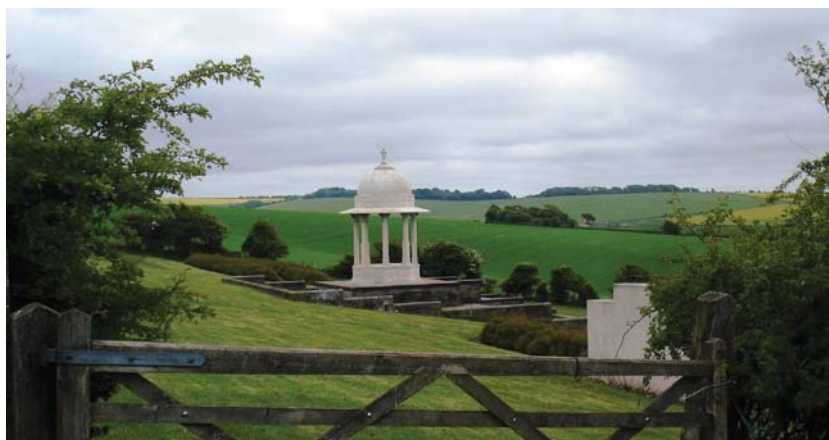
Figure 1. Chattri Indian Memorial site north of Brighton on the Sussex Downs.