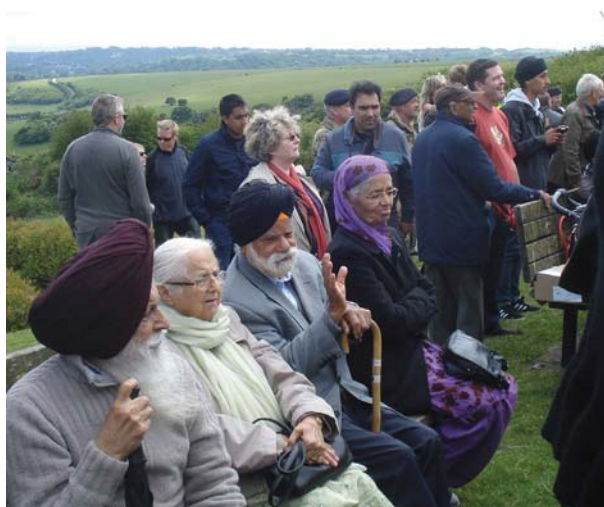
Figure 4. Participants assemble before the Chattri Memorial ceremony, June 2013.

What's really nice is no matter what's the weather, you'll still have a good turnout.... people still trek up there in their wellies or whatever, in their raincoats and wellies.... If I miss it, I feel quite guilty that I have missed it. I think that the first time I went, I went because my mom goes and I have to go and support this. Now it's something I take my children to. (Interview M, March 26, 2014)