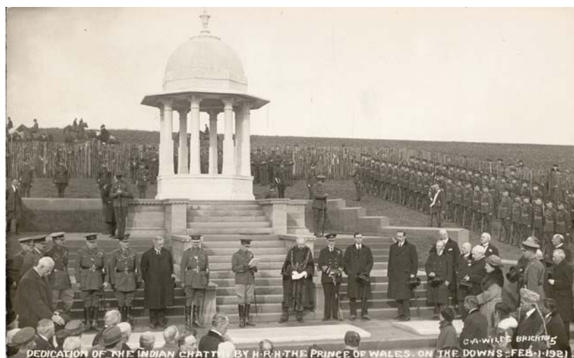
Figure 2. Chattri Memorial dedication ceremony, Brighton, 1921.

This memorial’s original valuation was thus based on its function as an imperial gesture in the wake of World War I. However the maintenance of historical value depends on continued enactments of rituals of remembrance. Instead, the Chattri was abandoned by the government after its unveiling,