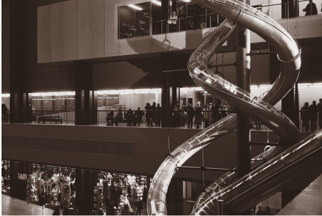
Test Site, a helical slide by interactive installation artist Carsten Höller at the Tate Modern.

An additional confusion has been introduced through interactive contemporary artworks, such as Carsten Höller's, that encourage visitor engagement. It can be all too easy for the visitor to then assume that "up close and personal" is acceptable behaviour with all works of art.