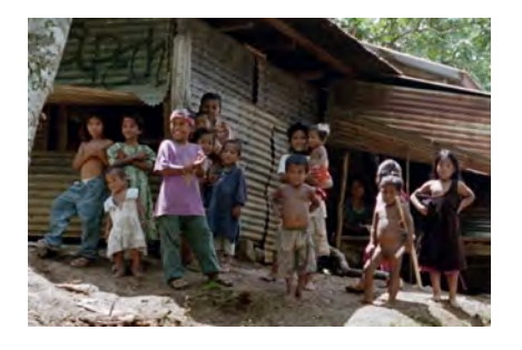
Children are most vulnerable to educational neglect, exposure to violence, and sexual exploitation.