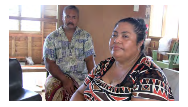
J and W are building a new future as they have been evicted from the home where they lived for many decades.