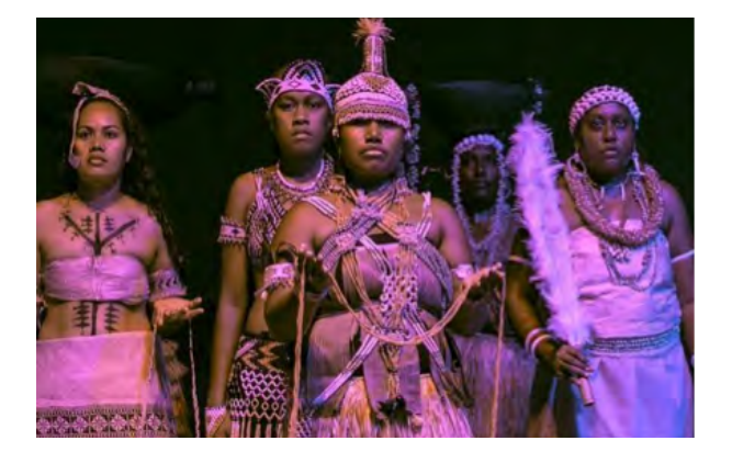
Women of Waves of Change advocating for women's rights and raising awareness on violence against women through theatre drama. The group was funded by EU as a three year project.

that men and women have in decision making processes within households and communities; but men have always dominated decision makings and leadership roles in these forums.