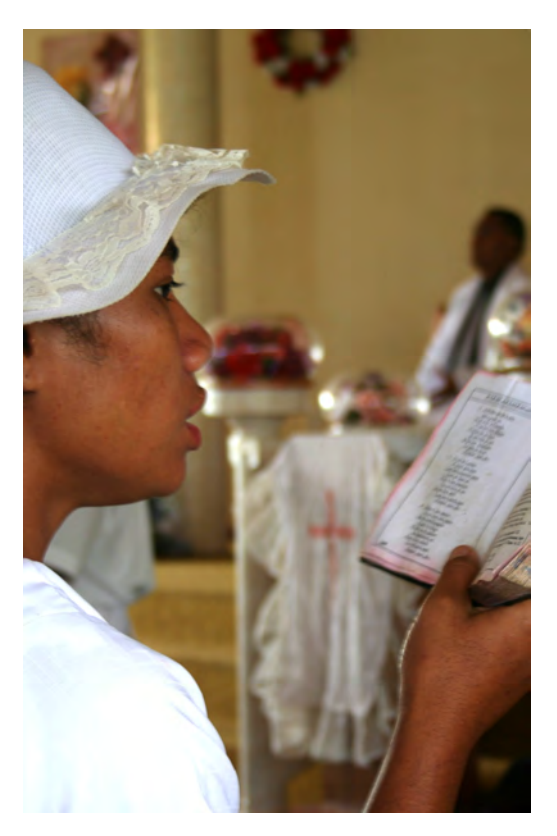
Samoans are a church-going people and often quote the Bible to support their worldview.

Concerning the rights of mothers over the fathers, woefully weak are fathers when beating up the mothers. What is evident is that if the father instructs the mother concerning the rights that are appropriate for their family it just gives courage to the old lady to be angry. But what is needed is to share, to talk. All the problems that occur in the family are caused by the mother."