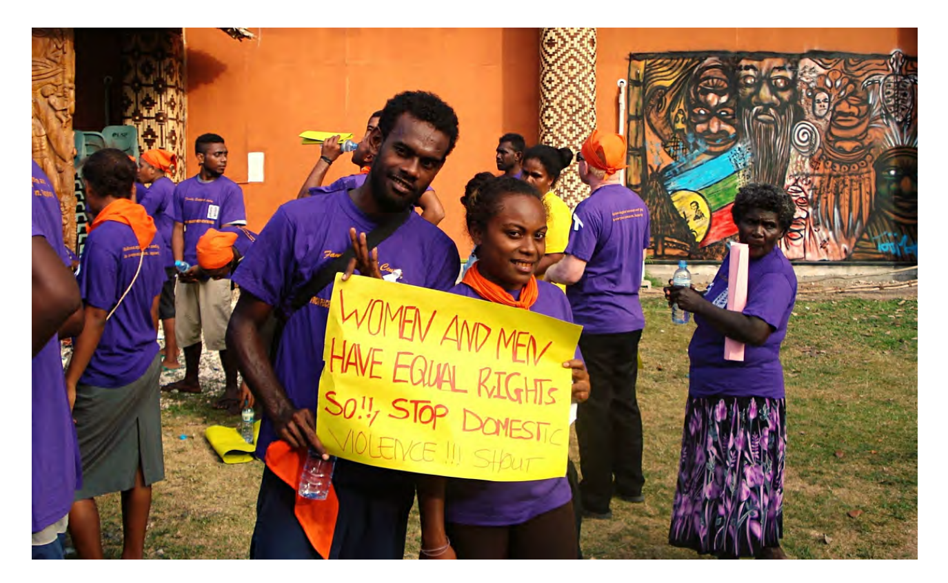
'Progress on gender equality in the Pacific Islands is gaining momentum following a pledge by political leaders' Catherine Wilson, theguardian.com 16 August 2014.

policies and programmes, gender parity on education and ending violence against women'.<sup>24</sup>