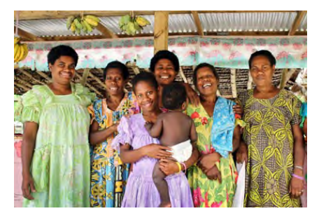
[Most ]Women do not know their rights in kastom ... or in the Constitution or international Conventions such as the CEDAW Constitution or international