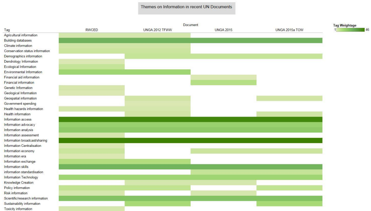
Figure 1: Thematic map of information appearing in four key UN documents

tags show the different information related themes appearing in the leading UN documents on sustainable development.