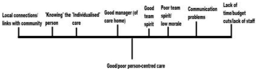
Figure 2. Discourses derived from themes emerging from folk domain analysis.