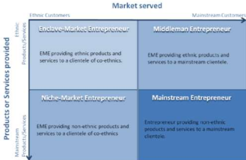
Figure 1: Typology of Ethnic Minority Entrepreneurs: market and product orientations

Source: Lassalle (2015), adapted from Zhou (2004), Rusinovic (2006, 2008)