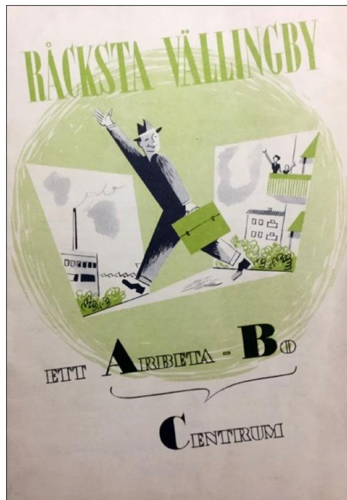
Figure 1: The front cover of a Swedish-language brochure produced by Stockholm's municipal real estate office. The text translates as 'Räcksta-Vällingby: a work-live

or spend time in its plaza, among other things. 28 Its centre became known internationally and, together with the wider spatial planning of the suburb, it seemed to contribute to the decisions of (a) the International Union of Architects to award the suburb the 1961 Patrick Abercrombie prize for town planning and (b) the Royal Institute of British Architects to award Markelius the 1962 Royal Gold Medal for Architecture.