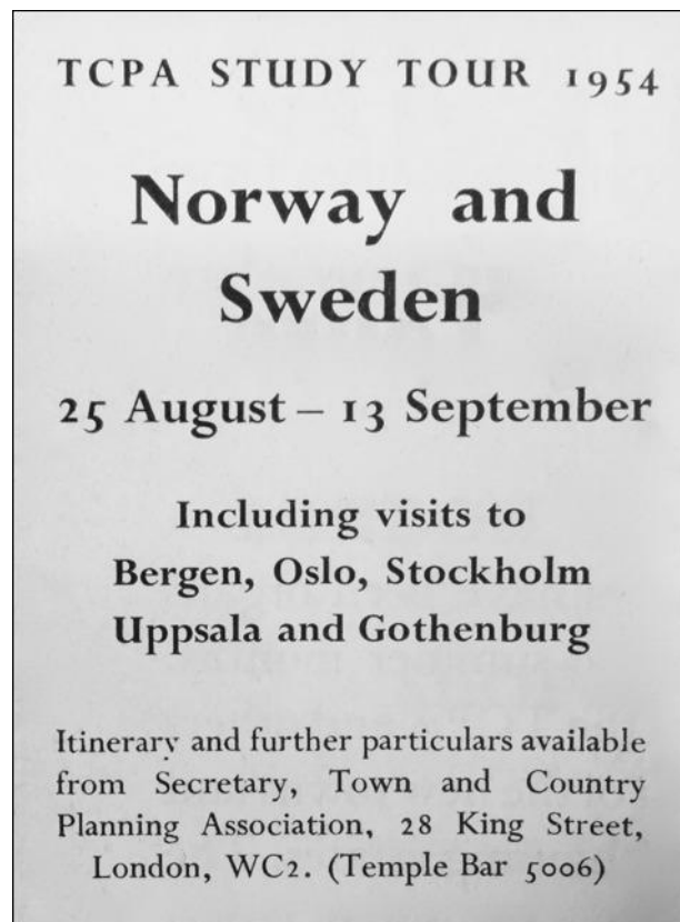
Figure 2: Advertisement for T CPA study tour to Norway and Sweden