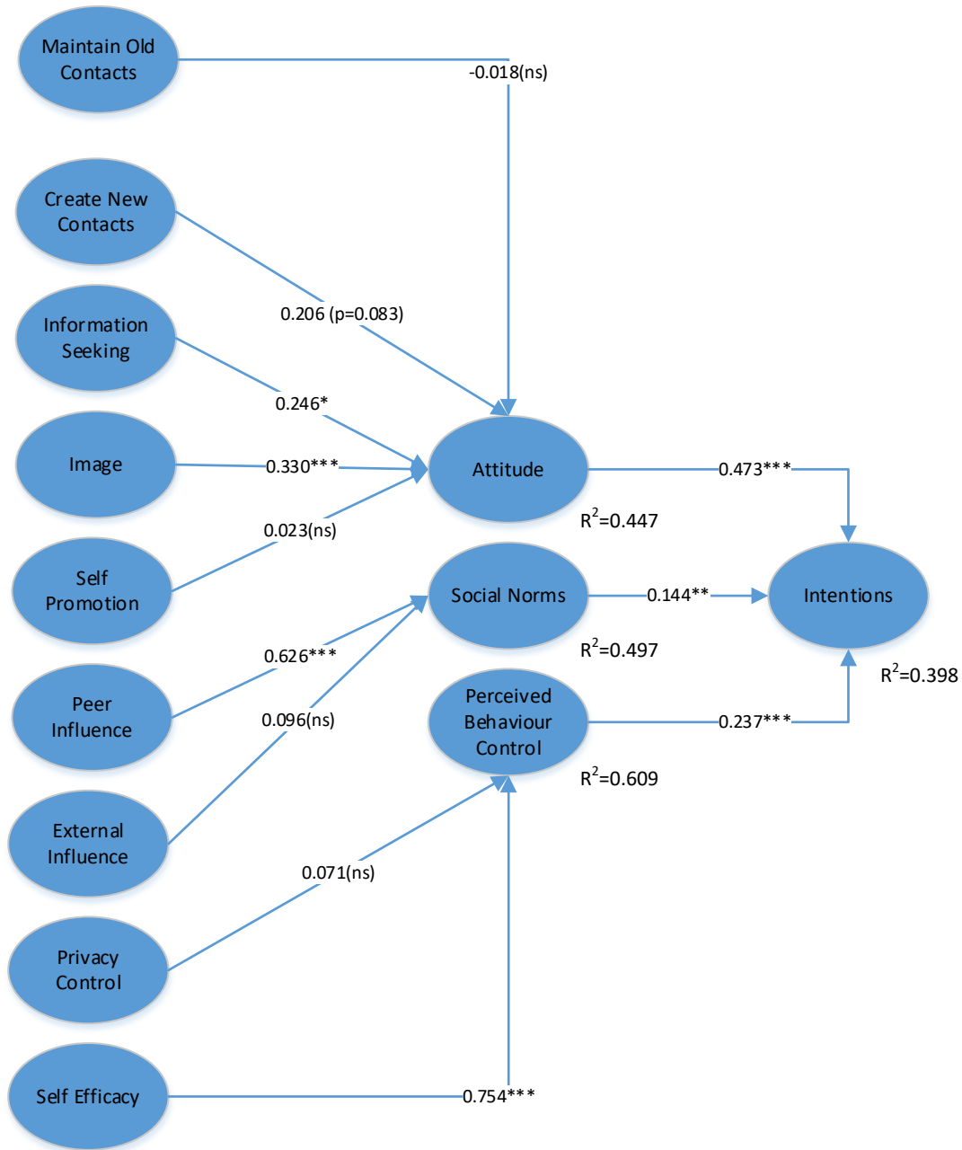
Figure 2. Results (**p < 0.001, *p < 0.01, *p < 0.05, ns = non-significant).