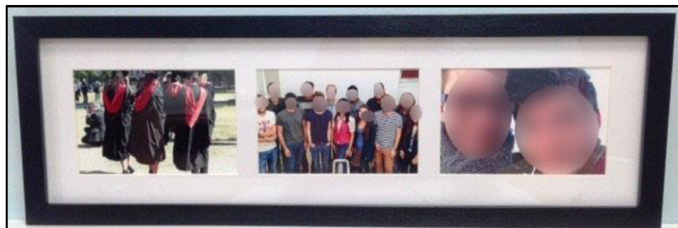
Fig. 3. Triptych photo frame example.

responded to their digital selves as presented in the different formats and what they learned from this process regarding the nature of their SM usage and performance of self. This was the analytical approach from the outset, and our findings represent the analysis of our complete data set. This led to the development of our key findings in establishing a dynamic curation framework, which represented the nature of our participants' response to their digital selves and is outlined below.