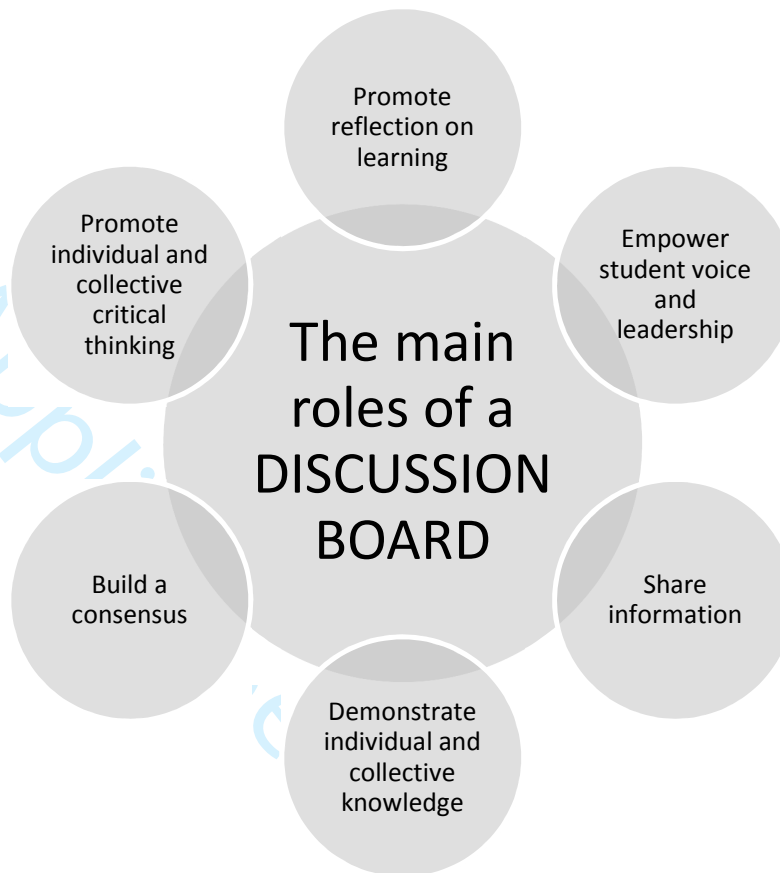
Figure 2. The beneficial roles of discussion boards in promoting learning in a community of practice (Xia, C., Fielder, J. and Siragusa, L., 2013)

Discussion boards have become an essential tool for the delivery of online study programmes, such as distance learning programme because they ‘offer great pedagogical leverage, for example, by promoting reflection, analysis and high-order thinking’ (Al-Jeraisy et al., 2015, 257). Although Krentler and Willis-Flurry (2005) amongst others report on the benefits of using discussion boards, Al-Jeraisy et al. (2015, 259) draw attention to ‘simply obligating students to post comments does not result in higher-order thinking, meaningful content, or continued interaction without the incorporation of reflection, blend, and application in the student posting process’. Ultimately, the educator must be able to devise a more holistic conception of teaching and learning in which the discussion board is a constituent component.