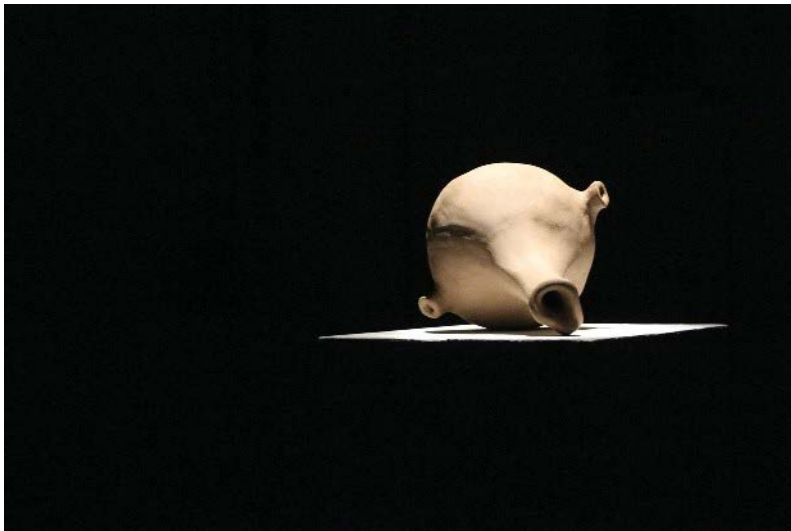
Figure 5: Louise Mackenzie (2016), Pithos . Installation Detail, BALTIC39. eight-channel audio, clay vessel, DNA plasmid bioassemblage.

My role paradoxically became nurturer and torturer as I anthropomorphized single cells, transposing my instincts with reductionist actions. Figure 4 shows quite literally the after effects of sampling one of my E. coli bioassemblage communities with the tip of a pipette. This is a part of the process of allowing the thought to remain alive, re-culturing the bioassemblages in fresh medium. The organisms roughly wrenched from their moorings by the pipette were actually the survivors. I began to imagine the incubator that they are placed in as a rocking, nurturing environment – no longer the manufactured aid designed to encourage growth on a factory scale, but a hospitable place that resembled (albeit clumsily) the movement of a gut, the E. coli 's ancestral home, then I realized that this surrogate gut was the home of these organisms, made not born. I started to wonder if I could not create a more supportive environment for my progeny: a vessel of care that would house the objects of my curiosity.