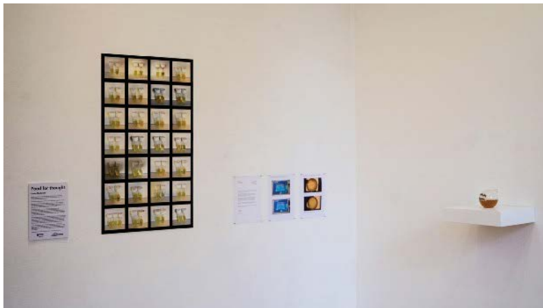
Figure 8: Louise Mackenzie (2017), Food for Thought , #FEED, Queen's Hall Arts Centre, Hexham, 8 July–26 August 2017.

The next stage of Wishful Thinking takes my respect for the organism closer to its logical conclusion by using the human body as site of experimentation. I will place a thought within my body (most likely cells that have been removed and grown in a plate) via a host that will infect it, imposing my will upon it. 1. This thought is volition, a will to act: held, external to my mind, yet internal to my body (cells). It becomes both a part of me and a synthetic other: an imposition to be respected. I will then nurture this externalization of my body and periodically determine whether my cells accept, reject or alter this synthetic will. The final stage (albeit at this point, purely conceptual) of this work is to reintroduce the cells, containing my will, to their naturecultural ancestral vessel: my womb, circumventing wishful thinking in the volition to use my body as the site of imposition.