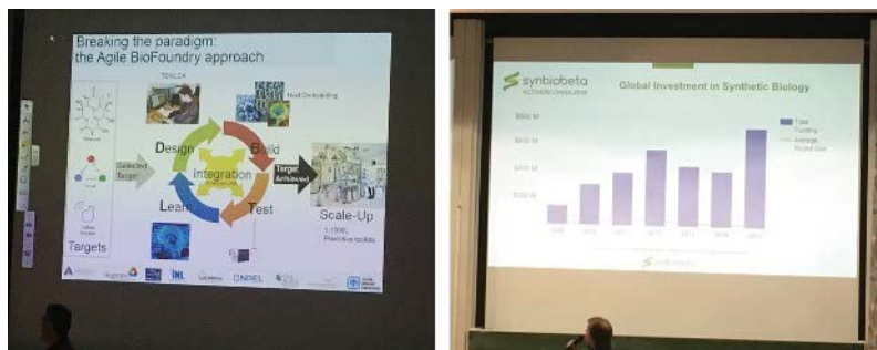
Figure 1: Louise Mackenzie (2016). Photographs taken on iPhone during presentations given at SynBioBeta Activate! 2016.

Synthetic biology uses the body of the micro-organism as vessel, imposing synthetic DNA upon the living cell for human value. The industry has become a lucrative one with both private and public sector investment growing and an increasing number of funded research opportunities in the United Kingdom alone (UK Synthetic Biology Roadmap Coordination Group 2012). The photographs in Figure 1 were taken at a synthetic biology incubator event held in Edinburgh in 2016. I invited myself along, imposing on a format clearly not intended for me. The majority of presentations showcased start-up companies that are developing ways in which to manufacture biomaterials faster and store them smarter. The slides depict the production, engineering and capitalist market rhetoric that pervades the discipline.