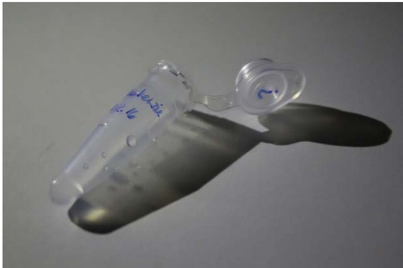
Figure 3: Louise Mackenzie (2016–present), BioAssemblage #1 . Thought translated into DNA and assembled in a plasmid DNA vector, Eppendorf tube.

In taking a thought and translating it into DNA, the result is a synthetic DNA plasmid. It is synthetic biological material that exists as an assemblage object, or as I have named it, a ‘bioassemblage’: in this case, segments of synthetic DNA that I have designed and then ordered online to be constructed on the genetic production line (Figure 3). The act of inserting this assemblage within the host organism ( E. coli ) renders the host genetically modified. The organism also becomes a bioassemblage on a larger biological scale: the result has no capital value, only naturecultural value (Haraway 2003: 8). It exists purely to test the boundaries of our biotechnological desires. The assemblage is technological, Deleuzian (Nail 2017: 21–37) and art-historical. It is a construction of parts and the fluid relations of these parts within a wider context. Thus while a bioassemblage appears to be a physical entity, it is also the thought that lead to the construction of the entity, the relation of the entity to the (microbial) body and (architectural) bodies that it travels through and the unknown future relations between the entity and the bodies that encounter it in the laboratory, gallery and beyond.