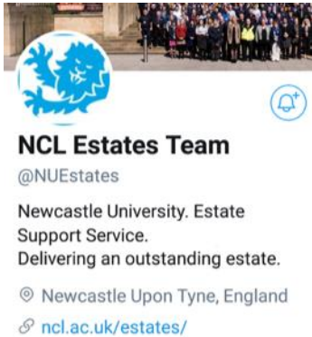
Figure 1: Existing engagement of the estates management team with students and staff on-campus via Twitter