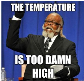
Figure 4: An image macro / meme. In making our Twitter bot more playful and relatable to our occupants (many of whom are undergraduate computing students), we can embed image macros in some tweets (where relevant— and where playfully irreverent).