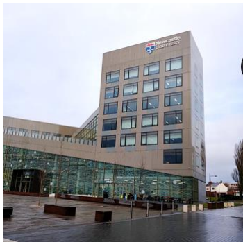
Figure 2: The Urban Sciences Building at Newcastle University. A Living Lab building designed to the BREEAM Excellent standard.

physical attributes of that space and in examining the role building data might have in negotiations of its use.