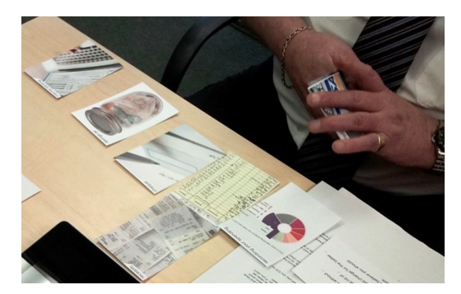
Figure 1. Prompt cards used in discussions with participants.

Participants were asked to go through the pack and respond to these four questions in their own time. Typically,