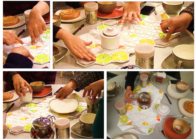
Figure 1. ActuEating: participants curiously exploring ActuEater2

DOI: https://doi.org/10.1145/3196709.3196761