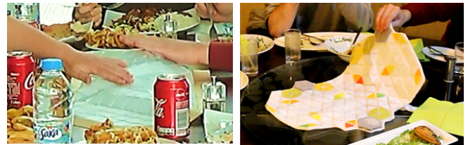
Figure 4. Interactions with ActuEater1 (left) and ActuEater2 (right)

by all groups when proximity-sensing was realized. Some covered up thermochromic parts with both hands to ‘feel the heat’. Some lent forward or backwards in their seats to test proximity. Some repositioned physical objects (that were initially placed randomly) precisely on particular parts of ActuEater2 to test them. Many were observed ‘tracing’ the colour-changing pattern with one finger in a continuous satisfying way.