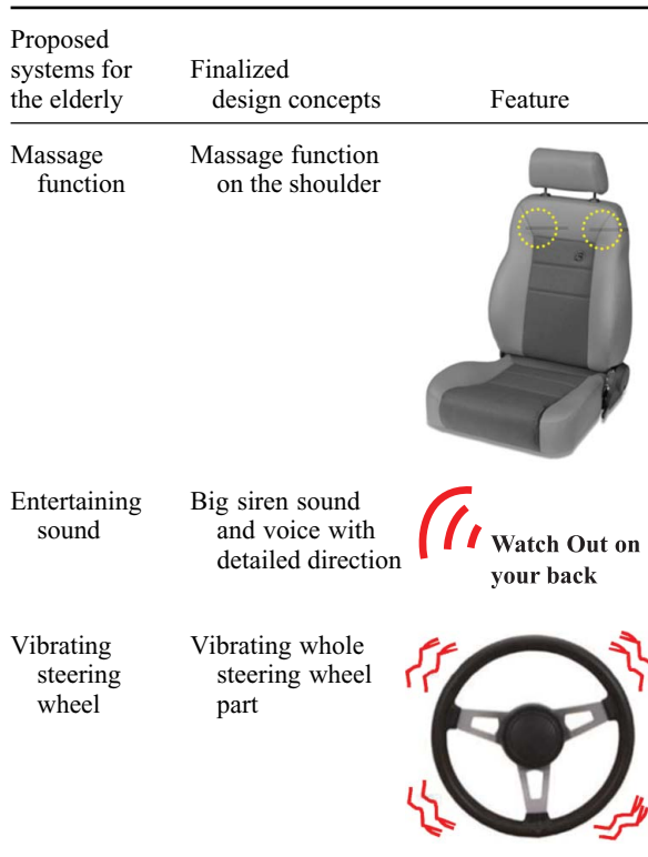
Table 4. Finalized concepts.

After finalizing the system feature concepts, a focus group interview was conducted to obtain their suggestions. During the interview, they suggested that if the massage function on the seat, the vibrating steering wheel function, and the big siren sound were integrated, the integrated system would be more beneficial for them. For example, when a potential collision situation arises, the shoulder massage function would activate along with the big siren sound. If these concepts were working at the same time, they would be more apt to recognize the situation and react faster. However, the elderly focus group said that if both massage and vibrating concepts were used at the same time, they would feel more confused.