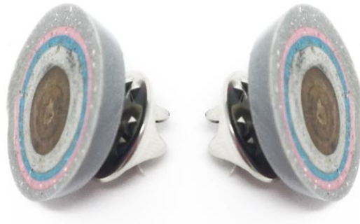
Figure Error! No text of specified style in document. 3 Chronos brooches by Nantia Koulidou 2017. A found twig, coloured resin and stainless-steel pin. Dimensions 2cmx2cmx2cm Nantia Koulidou © 2017 all rights reserved.