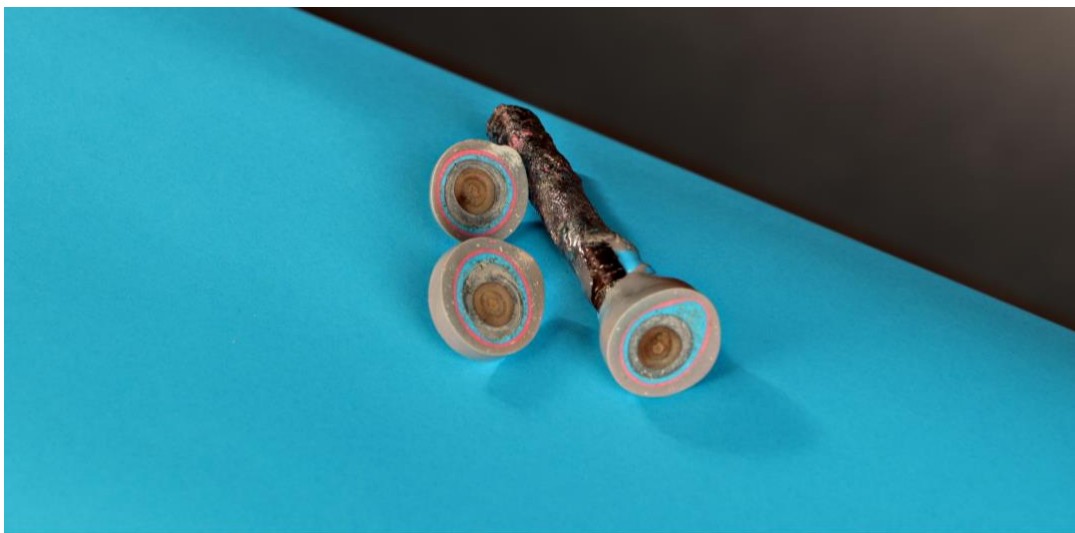
Figure 4 Chronos brooches. left to right. The twig is dipped in multi-coloured layers of resin and cut through. Nantia Koulidou © 2017 all rights reserved.