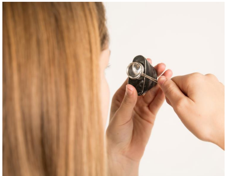
Figure 1. Topoi by Nantia Koulidou 2017. Milliput, Silver, found objects, electronics, film, magnifying glass. Looking through the glass. Nantia Koulidou © 2017 all rights reserved.