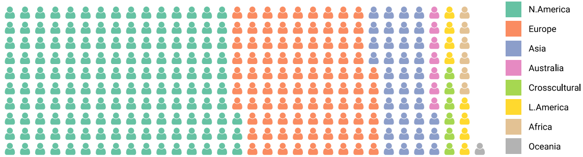
Fig. 1 Origin of samples. N. America, North America; L. America, Latin America and Caribbean