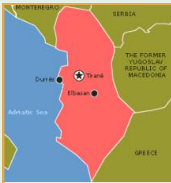
Albania

And it proved right. However, the most difficult participants to access were prosecutors which took me more time than expected as an informal 'clearance' by chief prosecutors was needed. In addition, in practical terms, it was difficult to find prosecutors in their offices as they were either in court sessions or dealing with state police in interrogating criminals or witnesses. It was also hard to rely on a scheduled meeting with them because a sudden criminal case would require them to go and investigate the crime scene. Sometimes, my interviews were interrupted due to urgent phone calls. This of course affected the flow of the interview and the schedule. I faced the same problem when interviewing judges in their offices. It's hard to realise how much time these obstacles can take. And if not properly thought through in advance they can seriously limit the number of participants,