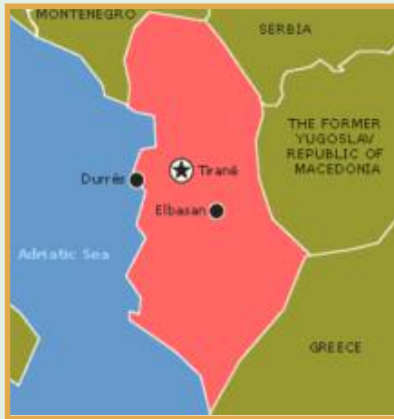
Albania

And it proved right. However, the most difficult participants to access were prosecutors which took me more time than expected as an informal 'clearance' by chief prosecutors was needed. In addition, in practical terms, it was difficult to find prosecutors in their offices as they were either in court sessions or dealing with state police in interrogating criminals or witnesses. It was also hard to rely on a scheduled meeting with them because a sudden criminal case would require them to go and investigate the crime scene. Sometimes, my interviews were interrupted due to urgent phone calls. This of course affected the flow of the interview and the schedule. I faced the same problem when interviewing judges in their offices. It's hard to realise how much time these obstacles can take. And if not properly thought through in advance they can seriously limit the number of participants,