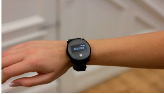
Figure 1. The cueing device.

(Figure 1). This was iteratively designed with pwPD and their caregivers. 24 This early study established usability and motor and social acceptability of the device we employed; that it was usable even by individuals with marked fine motor and sensory difficulties; and that a vibratory cue was preferable to an auditory cue. 24 The device delivers a silent vibratory cue, once per minute when switched on, to remind the person to swallow. The once per minute setting was decided upon in accordance with previous research which established daytime non-stimulated swallowing frequency in healthy adults of around one swallow per minute. 25 This was also the preferred interval selected by Marron et al. 23 in their study. There is, as yet, no literature relating to the swallowing rate of pwPD.