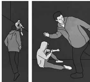
Fig. 3. Josh Cooper 27/03/2003 panels (© Angus Martin, 2017).

One illustration student took a meta-narrative approach to reinterpret the narrative. In his novella, the interviewee only appears as a side-