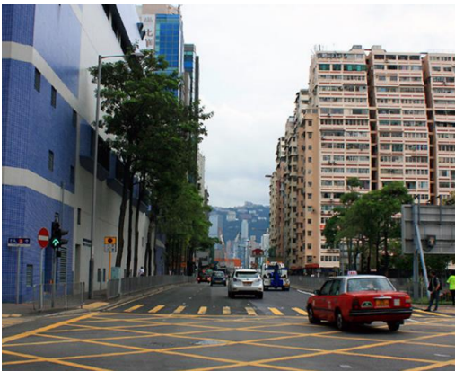
Figure 1. Comparison of Hong Kong public space: https://www.flickr.com/photos/old-hk

As we are now all citizens of cyberspace and cybercommunities (“cyborgs,” according to Mitchell, 1995) in the digital age, people are getting more and more obsessed with digital technologies, without any doubt, the digital network - the electronic agora today, has totally subvertes and redefines our notions of gathering place, community, and urban life (Mitchell, 1995). With the appearance and development of the digital world, our living space has been expanded, and the existing organization and structure have also been changed. Now we have not only physical public space but also digital public space with more unrestricted access to an open resource. Due to the emergence of the digital spaces, our physical spaces and some of the urban functions are also gradually being transferring. It has brought us more freedom with provides a networked, immaterial public space, but inevitably causes the migrating from physical space to digital world, which declines eye-contact, and makes physical public space get less relevant.