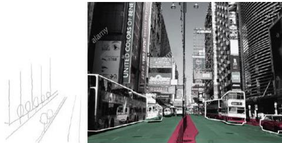
Main commercial street – Nathan Road