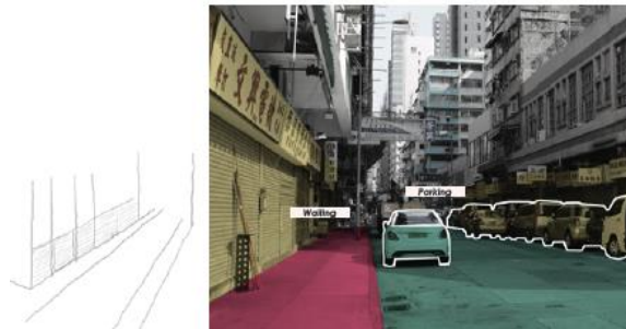
Residential street – Soy Street