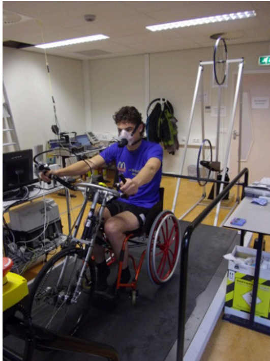
FIGURE 1 | The experimental handcycle, consisting of a wheelchair with a mounted handcycling unit in front of the pulley system on the motor driven treadmill.