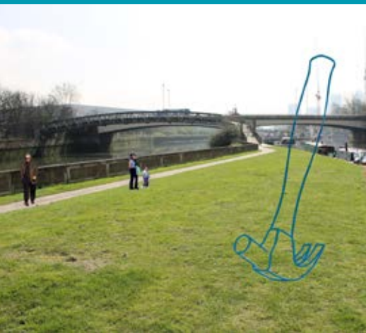
Michael Craig-Martin, The Hammer (blue), 2011