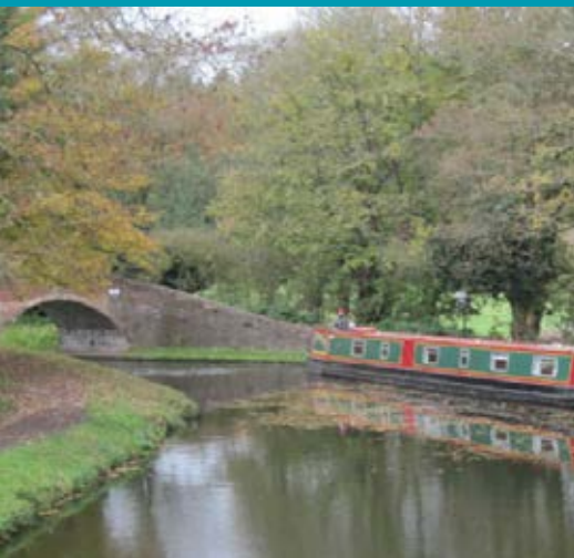
Staffordshire and Worcester Canal