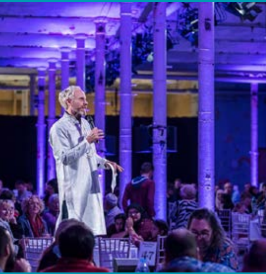
Shapes of Water, Sounds of Hope