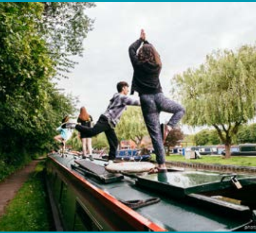
Dance on Water