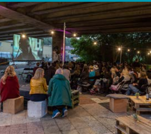
Floating Cinema, Another Country