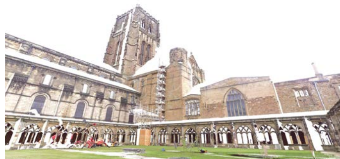
Figure 2: Example of captured laser scan data of Durham Cathedral

Within this pilot study the team used a FARO Focus 3D S 120. This survey-grade 3D terrestrial laser scanner is a phase-based panoramic-type scanner equipped with a built-in tilt sensor, barometer, and magnetic compass. The scanner has the ability to accurately capture up to 305° of an environment, at a range from 0.6m – 120m, up to 976,000 points per second, with a single survey point every 3.8mm, and to an accuracy of +/- 2mm from a 25m range (FARO, 2013). Over the course of two days, the team completed 42 scans to capture external and internal features of the chapter house. The result was a 250-million-point highly accurate point cloud of the site as well as a record of the intricate detail of the site's current condition (Figure 2). However, although very accurate and detailed, the resulting file size (8 gigabyte) was too large for efficient use within BIM based software. A key point for a scan to BIM process is to provide point clouds in both a file format and size that allows for efficient modelling work. The team opted to export the data as a e57 file, selected only the data required for modelling and exported at a density of 10%. The resulting file was significantly smaller in file size but retained more than enough points (10 million) to allow for efficient modelling to take place.