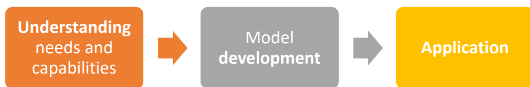
Figure 5: Simplified BIM Workflow

The challenges identified can be split into two distinct areas (1) information requirements (level of detail and access to information) and (2) current culture (technical skills and current culture and procedures). The latter is a significant barrier to implementing BIM workflows into heritage buildings, and one that needs further research before recommendations can be made. However, based on the research undertaken, it is possible to make recommendations in relation to supporting the challenges that fall within the area of information requirements. Current BIM processes for new developments follow three distinct stages (1) understanding the client's needs and project team's capabilities and (2) the development of a BIM to support collaborations, communication and coordination throughout the design and construction phases, and (3) application within construction and/or more increasingly to support facilities management purposes (Figure 5).