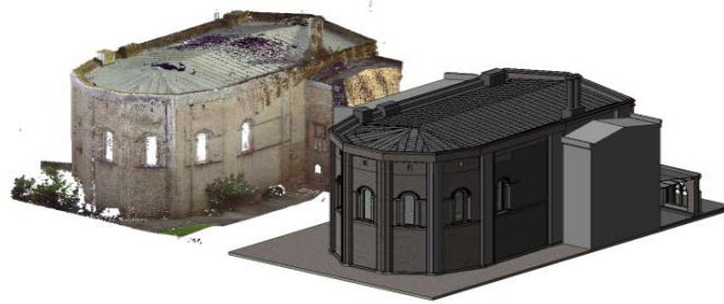
Figure 3: Point cloud data of Chapter House, Durham Cathedral and resulting BIM.

to it (Kelly, 2018). Even though this approach allowed for a more accurate model to be created, limitations in Revit did restrict the modelling approach, creating inaccuracies in the final model. One such error can be found in the southern wall, that was shown in the point cloud to lean out by 300mm from the vertical at the highest point of the wall. In consultation with the estates team at Durham Cathedral, it was decided to straighten this wall vertically within the BIM, to add a note to the wall highlighting the discrepancy and to provide the estates team with the point cloud to support any measurement processes. After the geometrical model was complete, a process was undertaken to populate the model with provided non-geometrical information (reports, condition classifications, comments, etc.) and parametric data, creating a data-rich ‘intelligent’ AIM of the chapter house.